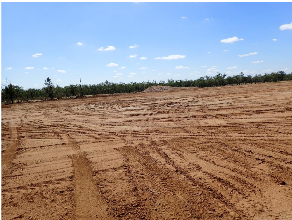
Figure 3 - Albany 1 drilling lease ready for Easternwell Rig 101 in mid-May

Pressure on east coast gas markets for more gas supply has not reduced and a number of available forecasts show a growing supply shortfall over the next several years. Work around a Galilee Basin pipeline connecting into the east coast market continues on a range of fronts. The focus for the Company over the next six to eight weeks, will be drilling and testing Albany 1.