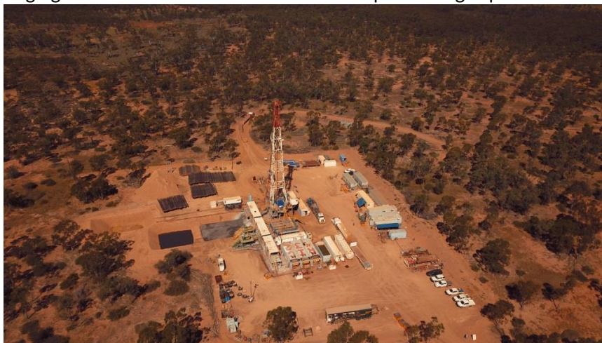
Figure 1 – Ensign Rig 932 on site at Albany 2