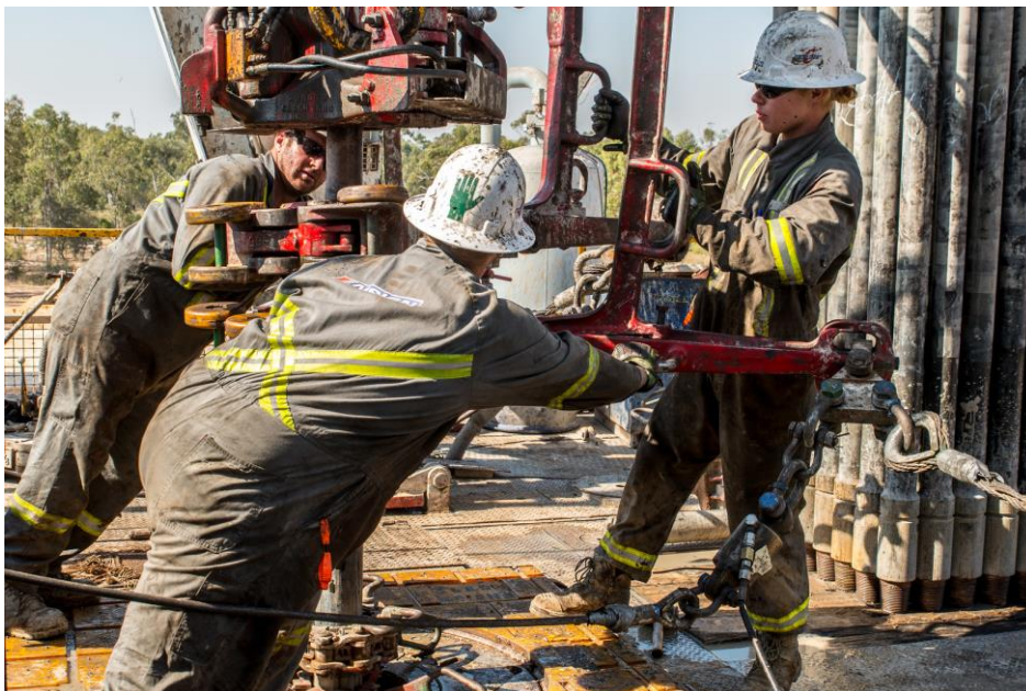
Figure 1 – Roughnecks at work on Ensign Rig 932 at Albany 2

Once the rig is released from Albany 2 the rig will commence the move to the Albany 1 site to side-track the Albany 1 well. Once drilled and logged, production casing will also be run in Albany 1ST in preparation for the stimulation and testing of both Albany 1ST and Albany 2. Condor Energy Services Pty Ltd has been contracted to perform the stimulation of both wells, after which well testing will occur.